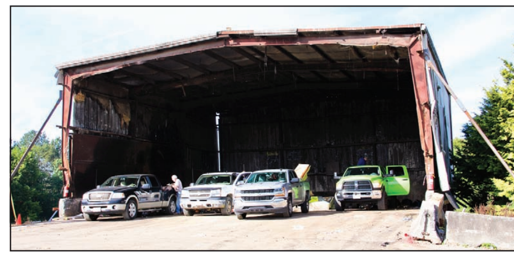
The commercial dumping shed at the Union County Transfer Station has been deemed unsafe for continued operation and will be shut down for renovations starting next week.

Government's estimate, the temporary closing period will add an average of three hours Residential garbage and per week to the driving time recycling will not be affected of the seven garbage pickup services that operate locally. See Transfer Station, Page 2A